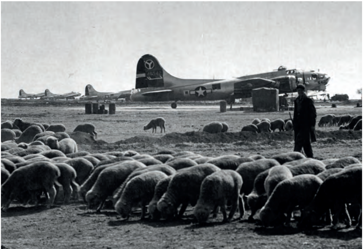
It was not always wet and uncomfortable: the airfield of 2nd Bomb Group, 20th Bomb Squadron, in Amendola on 19.IV.45 was an idyllic location with grazing sheep. (HF)

Prioritized, the 15th USAAF was ordered to fulfill the following tasks: