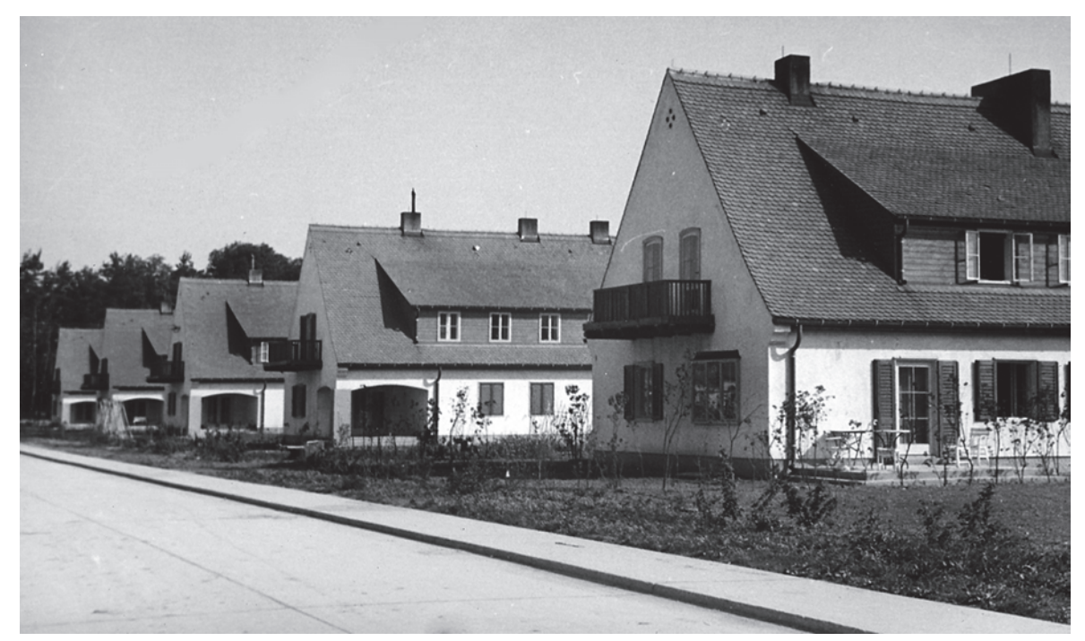
The five apartment buildings type 4B of KA 215a in spring 1943. From right foreground to left rear: a part of Herzograd 22, then Herzograd 24, 26, 28 and 30.

The fourth and final phase of KA 215a, was built to the north of the staff hall of residence. Here, the layout was modified to provide three entrances rather than a central one in the middle of the building. Each of the external entrances led to the ground floor apartments. The middle one directed residents up a stairway to the two upper floor apartments. 136 Five type 4B apartment houses with three entrances each were built (nowadays Herzograd 22, 24, 26 and 28). A further two type 4B apartment houses featuring three entrances were constructed directly to the north of the staff hall of residence (today Herzograd 17 and 19). Then came two longer type 4C residential buildings, both of which were made up of two joined apartment buildings with one central entrance each, and separated by an oval-shaped road (nowadays Herzograd 21 and 23, plus Herzograd 25 and 27). 137