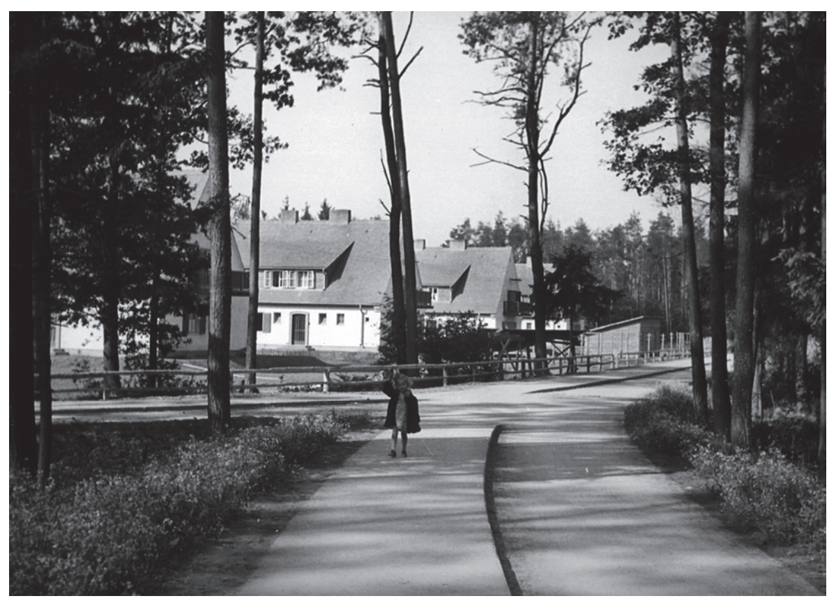
The bicycle track and footpath led from Langenhart northward, passing by the type 4B apartment buildings of the Herzograd estate, to the Nibelungenwerk (spring 1943).

The road through the Herzograd estate was surfaced with concrete and had a sidewalk. Street lighting was not yet available. The inhabitants could reach their workplaces in the Nibelungenwerk via the Werkstrasse or by a dedicated cycle and footpath. Parts of this cycle track and footpath still exist today. 139